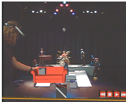
Fig. 3. Positioning a virtual couch that is part of a Tangible Unit. The Tools on the right side can be used to play back animations.

The use of voice commands is consciously limited to avoid the cognitive burden of having to learn many different symbols as well as to minimize interference with the communication between users. Voice commands are used solely to trigger functions and can be replaced by alternative trigger mechanisms, e.g. a pressed button of a wearable input device, depending on the individual requirements of the user or the particular environment.