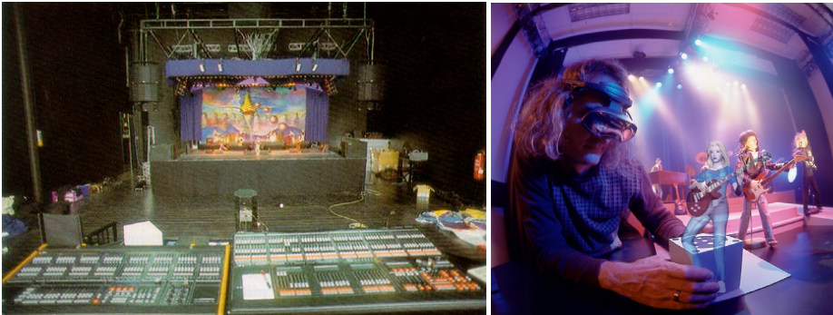
Fig. 1. The real model stage without virtual objects (left) and virtually enhanced as Mixed Reality Stage (right).

In order to support collaborative planning, a system needs to provide an appropriate user interface and it must respond to user interaction in real time. Many VR user interfaces do not facilitate the cooperative editing of virtual objects, nor do they consider a face-to-face collaboration among participants. In addition, the support of multiple users is often disappointing in terms of immersion (e.g. in CAVE-like environments). The real time capabilities of most VR systems are also very limited. A sufficient visualization of material properties is not yet feasible in real time. The same is true for professional lighting simulations which are often based on several hundred independent light sources. An example for a VR based planning environment that has successfully been used to plan stage shows is X-Rooms 0. The system uses stereo-projection and polarized filters to visualize 3D computer graphics and touch screen, joystick, mouse and steering wheel for interaction. A drawback of X-Rooms is the separation between working and presentation space, though.